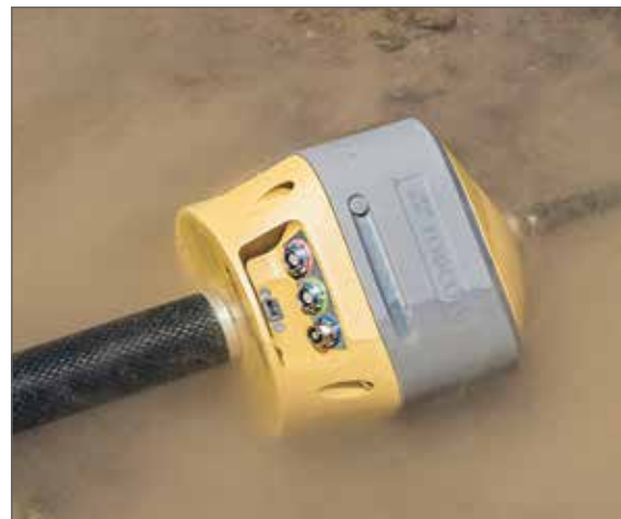
IP67 Waterproof Rating

Awkward shots on steep slopes or hard to reach spots are now a breeze with TILT™.